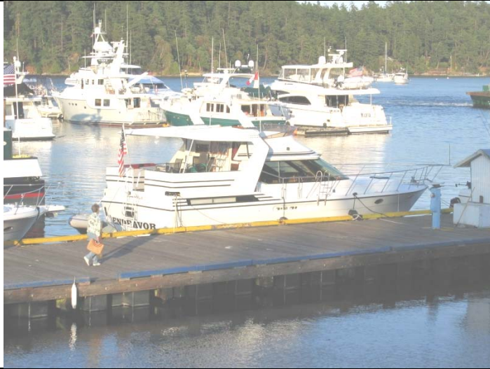
Friday Harbor Commercial Dock