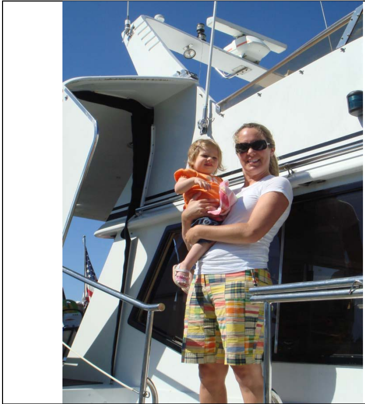
“Ganbled with death and won again!”