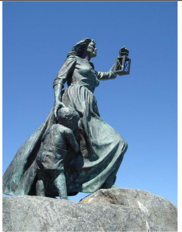
“To She who Waits!”